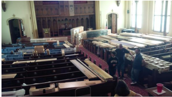
The process begins: various organ parts in the sanctuary -Mary Ann Croft

incorporation in the new organ. Installation should be completed by December with final tuning scheduled for January.