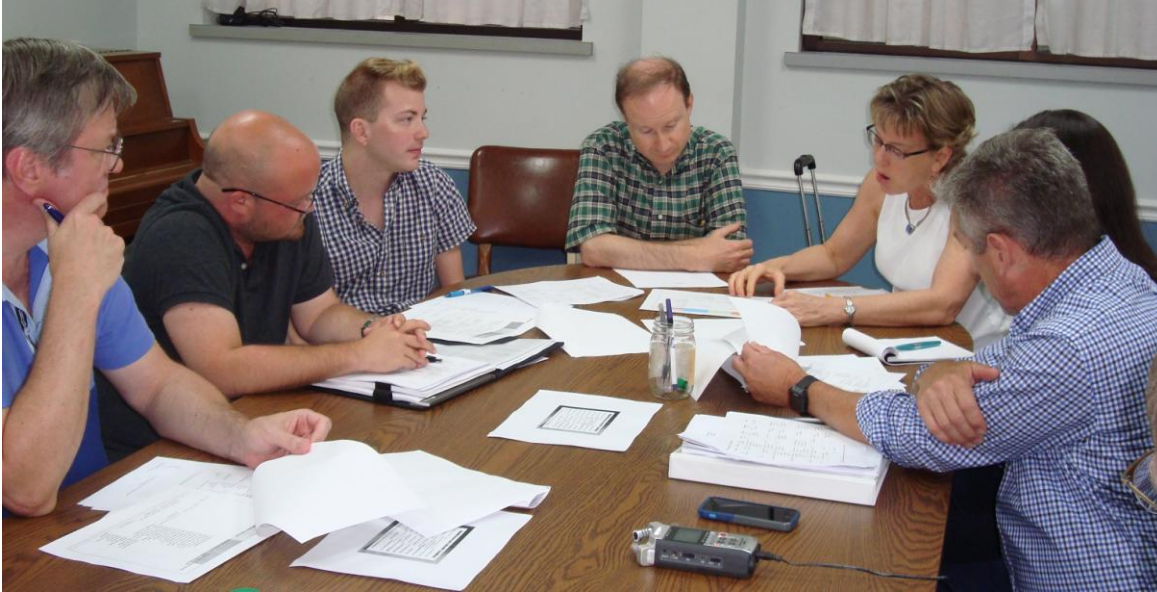
POEA2017 Steering Committee members review plans with the Chapter's Executive Committee